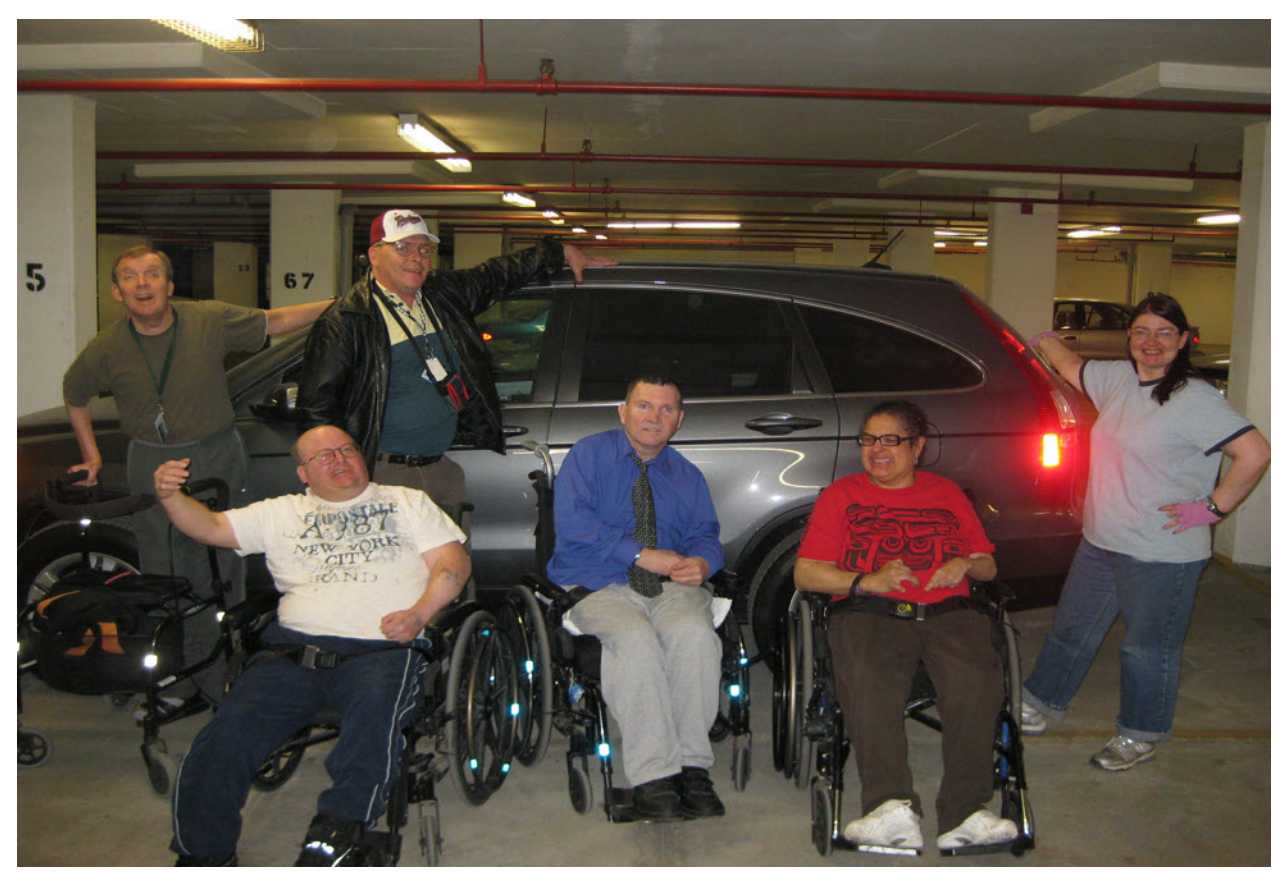
Aldebrain Gets a New CRV! - CHIRS received funding to purchase a new Honda CRV vehicle to help support clients with their transportation needs. Congrats!