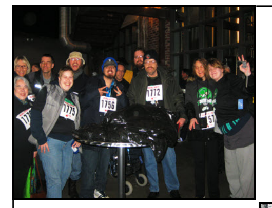
The St. Patrick's Day Run/Walk is an annual fundraiser hosted by Achilles Canada, a non-profit organization that provides people with various disabilities an opportunity to receive the physical, psychological, and communal benefits of running.