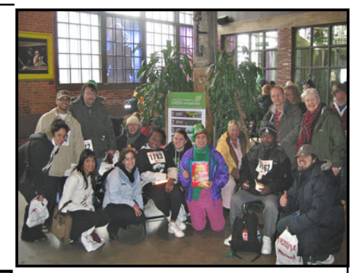
This year, the CHIRS community braved the rain and the time change to make this event both a success and super fun day for all! Just look at all the smiling faces!