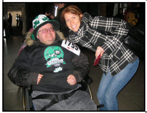
A very special thanks to all who participated!