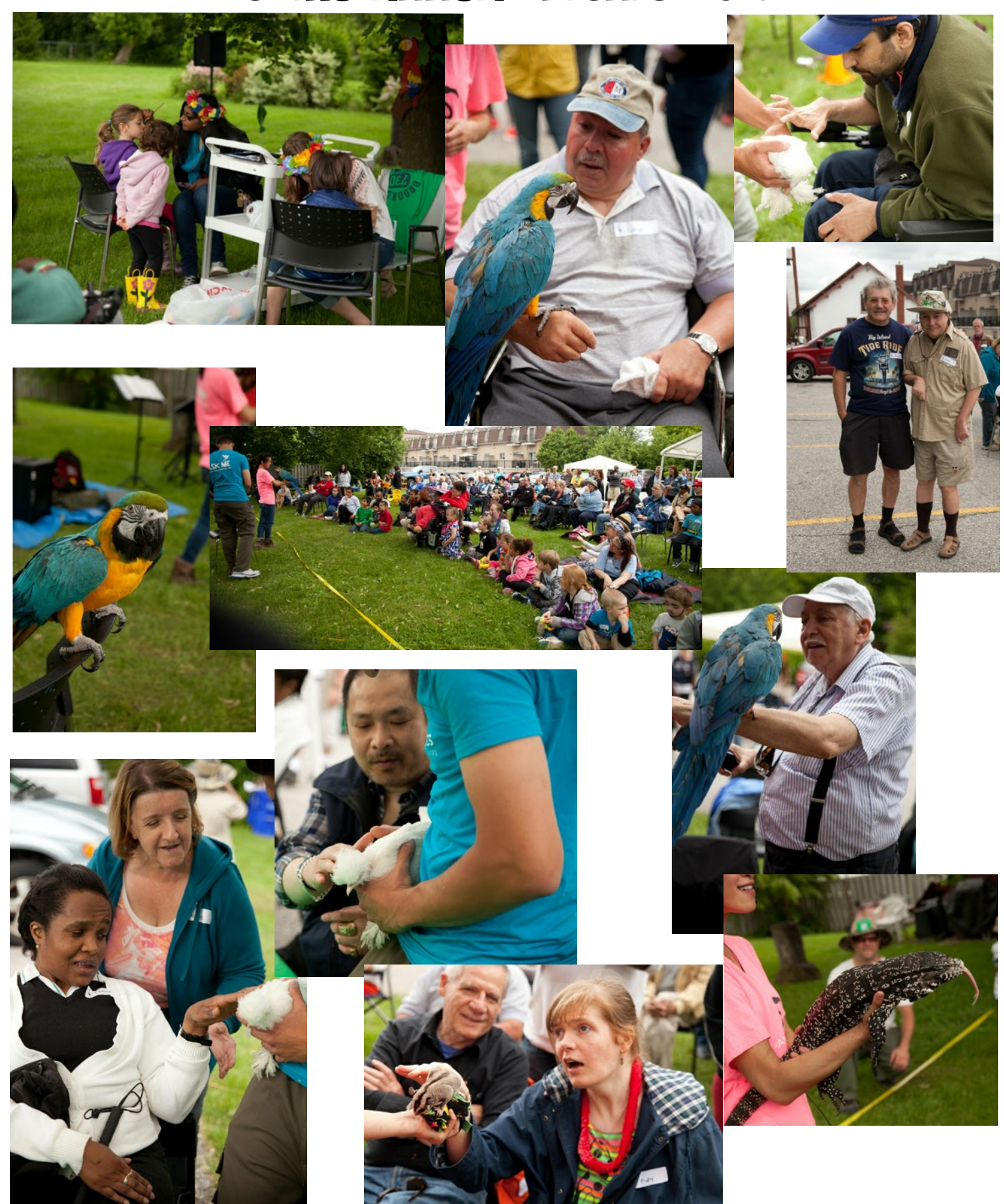
Community Head Injury Resources Services Toronto (CHIRS) 62 Finch Avenue West, Toronto, Ontario M2N 7G1