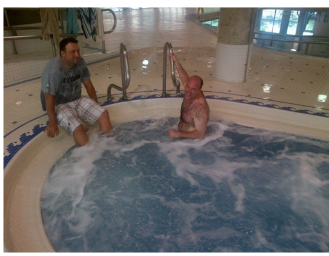
Community Head Injury Resources Services Toronto (CHIRS) 62 Finch Avenue West, Toronto, Ontario M2N 7G1

Tel: (416) 240-1149 Web Site: www.chirs.com E-mail: chirs@chirs.com