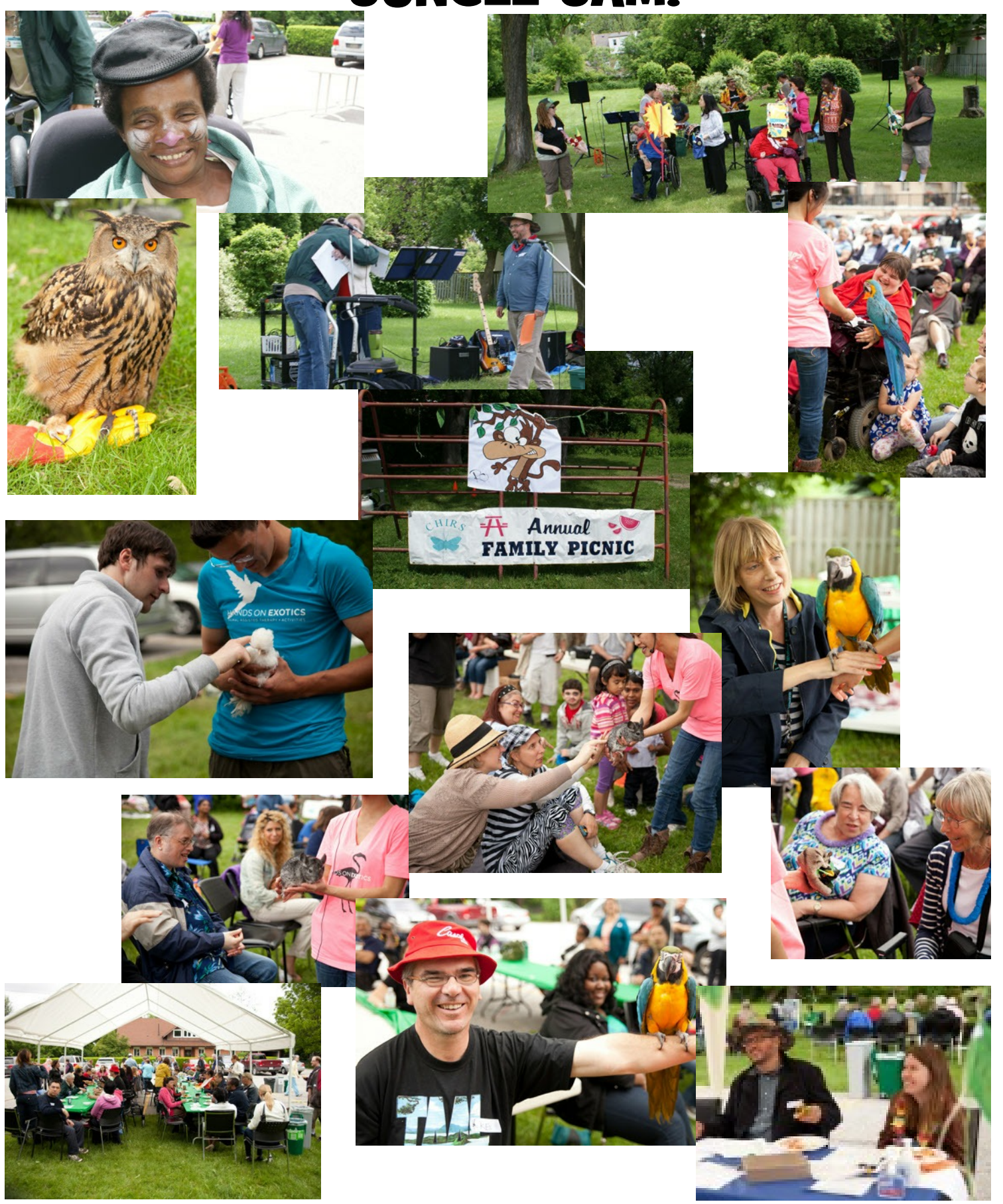
Community Head Injury Resources Services Toronto (CHIRS) 62 Finch Avenue West, Toronto, Ontario M2N 7G1

Tel: (416) 240-1149 Web Site: www.chirs.com E-mail: chirs@chirs.com