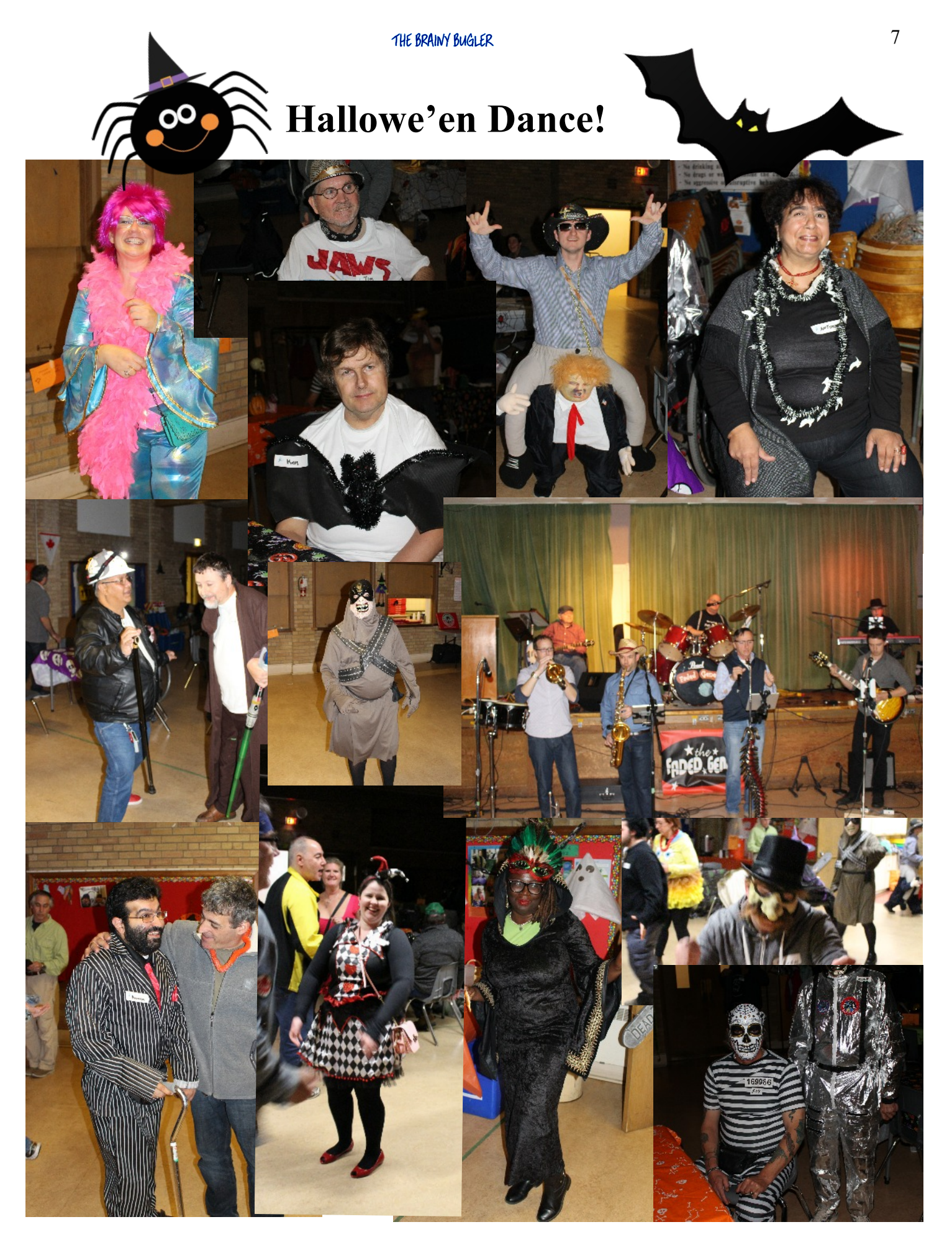
Community Head Injury Resources Services Toronto (CHIRS) 62 Finch Avenue West, Toronto, Ontario M2N 7G1